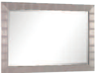
Deco stripe mirror in silver, (H)75x (W)106cm, £127, John Lewis