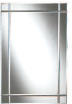
Art-Deco glass mirror , (H)90x(W)60cm, £44.98, the Colours Collection, B&Q