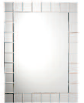
Brooklyn mirror , (H)40x (W)32cm, £160, Bhs

Create a focal point with a statement vanity mirror