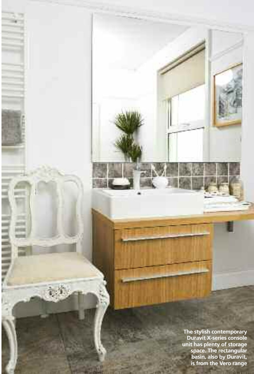
The stylish contemporary Duravit X-series console unit has plenty of storage space. The rectangular basin, also by Duravit, is from the Vero range