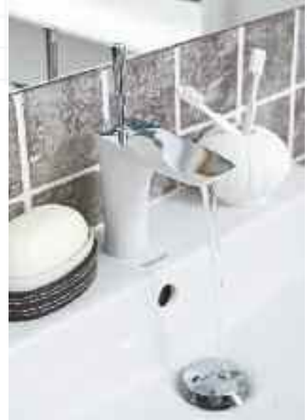
The splashback's Nero tiles are from Tilewise and make an almost exact match to the flooring