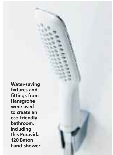
Water-saving fixtures and fittings from Hansgrohe were used to create an eco-friendly bathroom, including this Puravida 120 Baton hand-shower